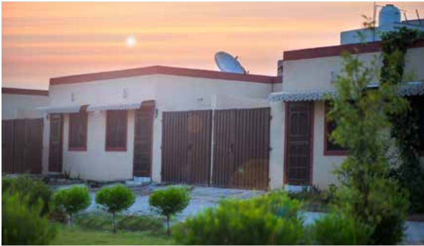
FIGURE 4 AMC Housing in Faisalabad, Pakistan.

AMC develops affordable housing within or close to large cities such as Faisalabad, Lahore, Multan, and Peshawar. AMC builds culturally sensitive houses in desirable communities for the bottom 40% of the population. With Reall's financial support, AMC have constructed over 700 homes and serviced plots with 4,000 more in the pipeline. This makes AMC one of the largest partners in Reall's global network.