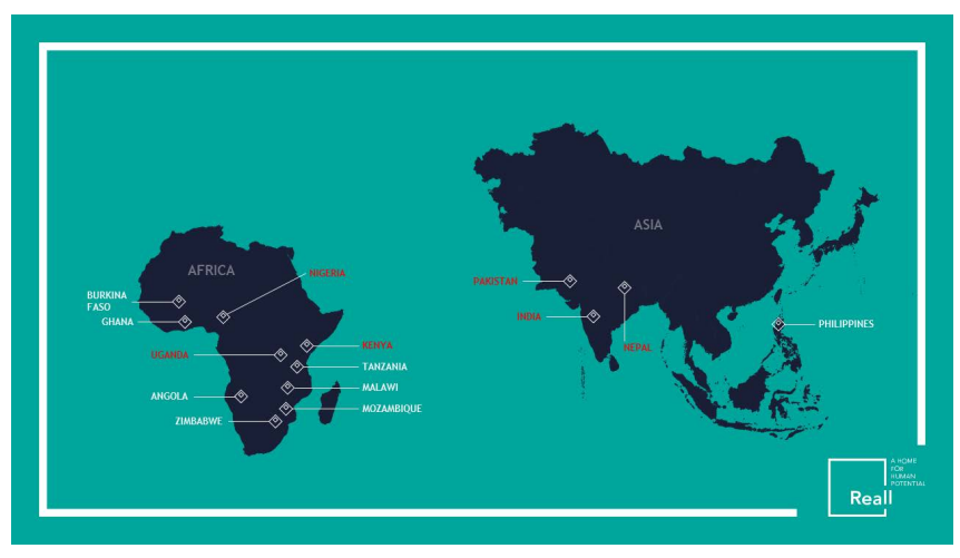
FIGURE 1 Reall's global network, with priority countries highlighted in red

Supported by the UK government (FCDO) and Swedish government (Sida), Reall is an innovator and investor in affordable housing for people on low incomes in urban Africa and Asia. With over 30 years' experience in the sector, Reall catalyzes socio-economic development outcomes for the bottom 40% of the income pyramid through commercially viable