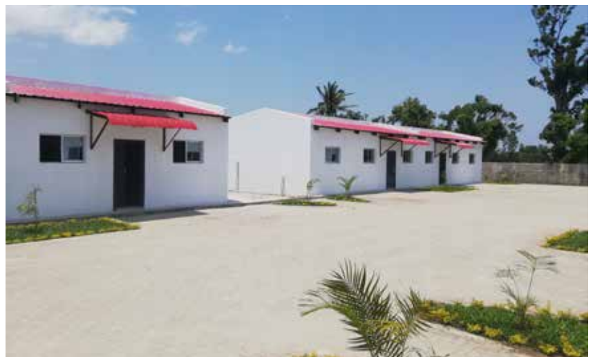
FIGURE 3 Casa Real housing in Beira, Mozambique.

Through this partnership, Absa Mozambique has moved significantly downmarket. Interest rates have fallen to the national 'prime rate' (18% as of August 2020) plus a small margin of 0.25%. Deposit conditions have been reduced to a minimum of 5% of the property selling price, increasing the loan-to-value ratio (LTV). As part of its agreement with Absa, Casa Real identifies customers, facilitates agreements with employers, assists in opening bank accounts, provides relevant documentation for the houses (such as real estate