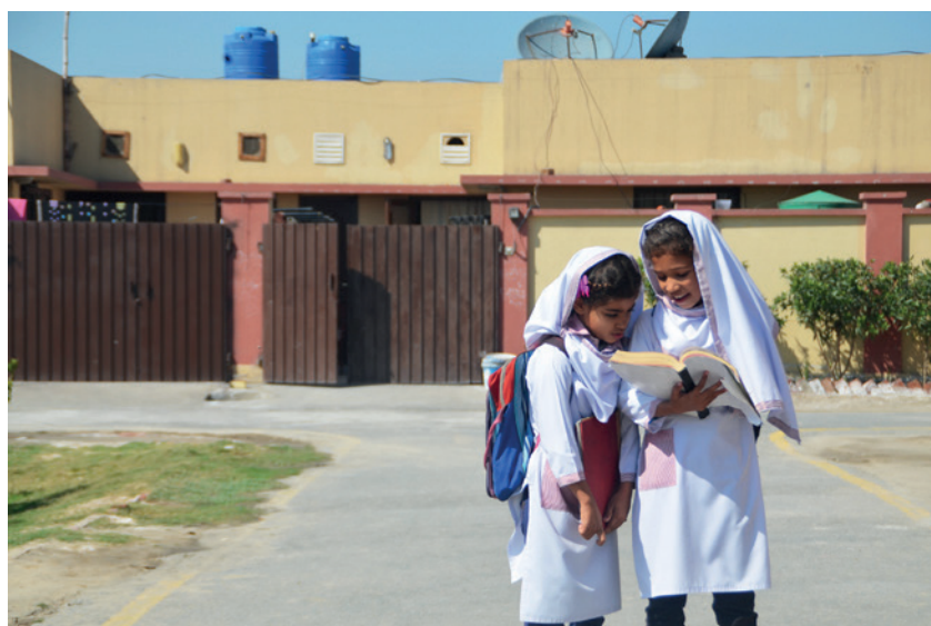
FIGURE 5 Girls travelling to school from their homes in an AMC affordable housing community, Faisalabad, Pakistan

In parallel, the government has pushed through key reforms relating to foreclosure laws and land registration, that collectively make mortgage financing a more attractive commercial proposition. 21 Despite these initiatives, many established Pakistan banks remain risk adverse in their attitude towards long-term affordable housing loans and the low-income segment. However, it is clear that a more conducive housing finance environment is slowly emerging – reflected in a growth of the housing and construction loan portfolios of Pakistan banks by 54 billion PKR ($350 million) between July 2020 and March 2021. 22