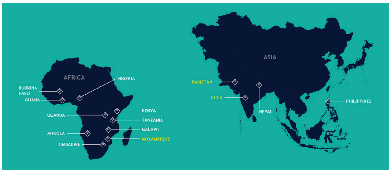
FIGURE 1 Reall's Global Network, with location of case studies highlighted

One year later, this follow-up article revisits these three case studies to update on progress and evaluate further developments. As the original piece was authored on the cusp of the global Covid-19 outbreak, this also provides a timely opportunity to reflect on how the shocks of the pandemic have impacted on the affordable housing and