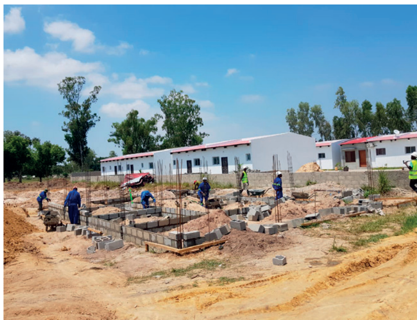
FIGURE 4 Casa Real affordable housing development in Beira, Mozambique

Casa Real's partnership with Absa Bank to make formal housing finance accessible and affordable to lower-income borrowers is therefore genuinely revolutionary in the Mozambique context. In Spring 2021 Absa fully approved the first Casa Real customer for a long-term housing mortgage loan. This is itself worthy of celebration as the first inclusionary commercial mortgage in the history of Mozambique. 11